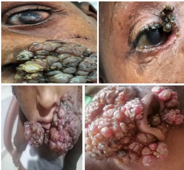
Figure 1: Fungating facial mass, and opacity in both eyes

Conclusion: Candidiasis is one of the most common causes of invasive fungal diseases in the immunocompromised. Key challenges to managing invasive candidiasis include prevention, early recognition, and rapid initiation of appropriate antifungal therapy.