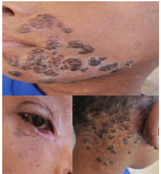
Figure (3): Response to antifungal treatment